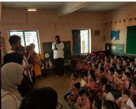
HAND HYGIENE TECHNIQUES