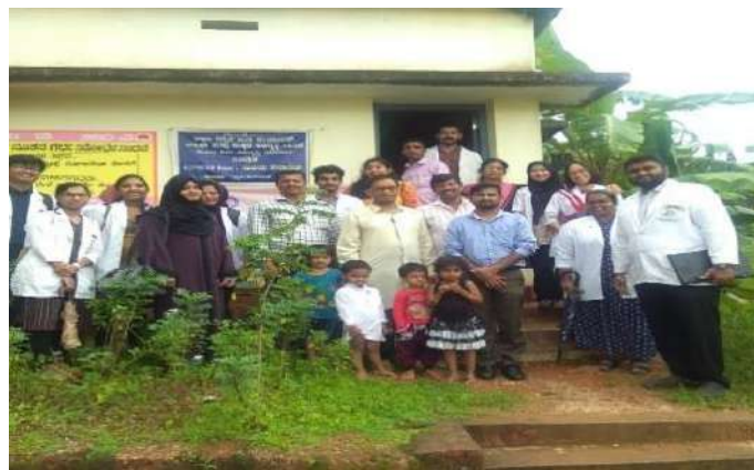
Figure 1: Anganwadi Health Education