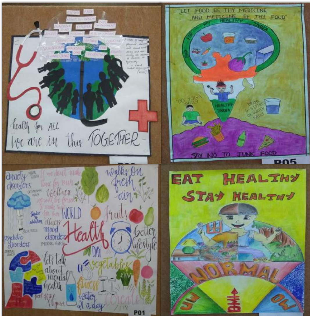
Posters presented at the competition

The Valedictory was conducted on 25 th April 2019 at 2:00pm at Indoor Auditorium, Academic block, YMC.