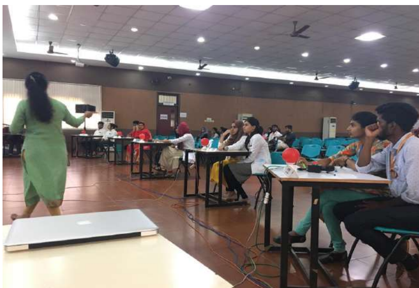
Participants at the Quiz Competition