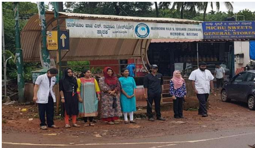
FIGURE 11: NUKKAD NATAK

The team members participated in the street play and Nukkad natak programmes along the streets of the Sajipanadu Village, School area.