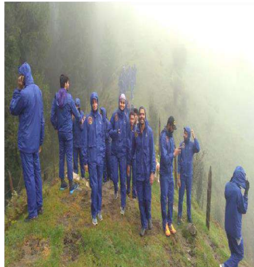
Figure 2: The Shirkoot Peak, Narkanda- 8500 feet