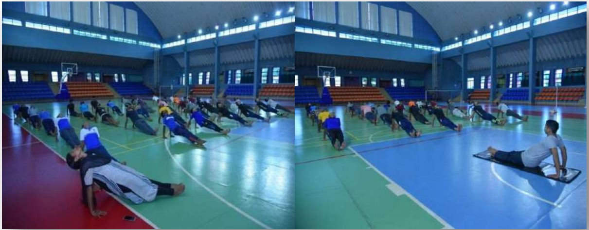
Demonstration of Pranayama for the Nursing Student on 06.06.2018 organised by NSS Unit of Nursing College