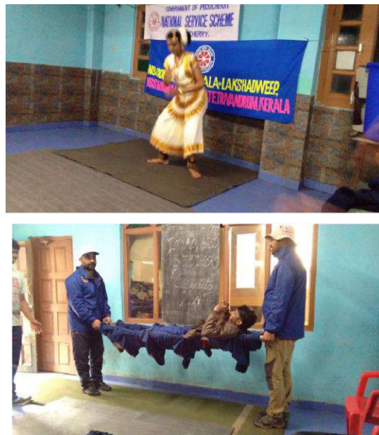
FIGURE 1 CULTURAL ACTIVITY AND DEMONSTRATION MODIFIED STRETCHER IN RESCUE