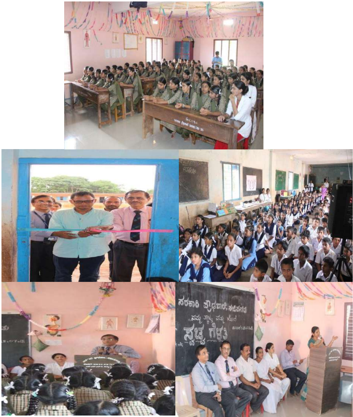
Figure 13: Swacha Gelathi & Personnel Hygiene, Inauguration of model competition

The students of the primary school of Sajipanadu and the volunteers of the Yenepoya Dental College had organized a Swachhata Mela with the model presentation done by the students with their mentors