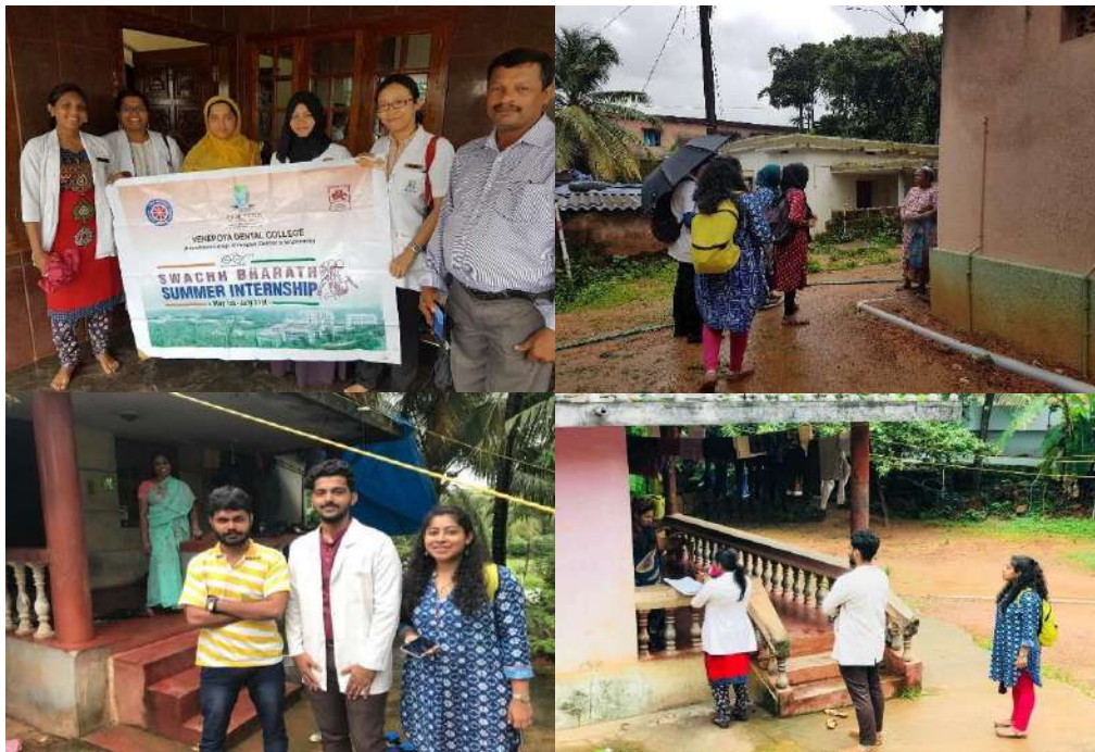
FIGURE 9: HOUSE TO HOUSE SURVEY BY INTERNS