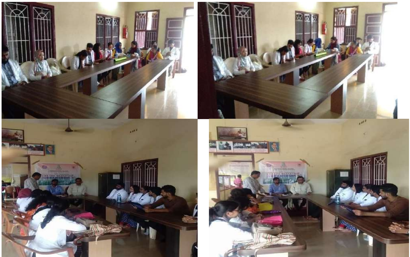
Figure 15: Planning for the Biogas plant

The bio gas plant at school area was discussed and cost and company was finalized and it was decided that the central government should fund such programs.