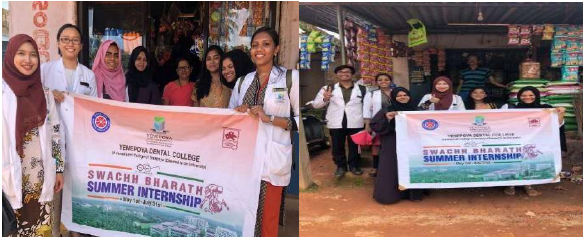
FIGURE 10: COMMERCIAL SHOPS AWARENESS PLASTIC AND ITS HARMFUL EFFECTS