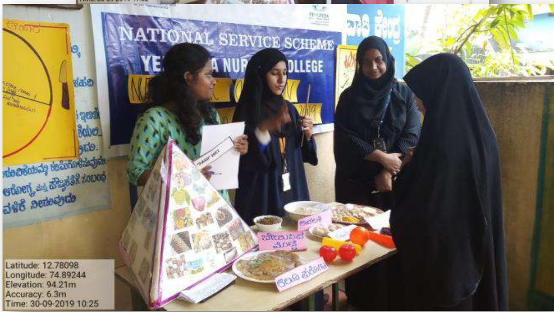
Latitude: 12.78098 Longitude: 74.89244 Elevation: 94.21m Accuracy: 6.3m Time: 30-09-2019 10:25