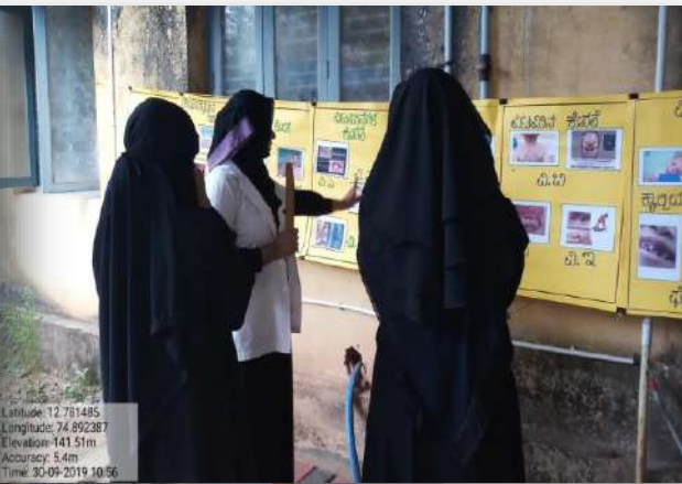
Latitude: 12.781485 Longitude: 74.892387 Elevation: 141.51m Accuracy: 5.4m Time: 30-09-2019 10:56