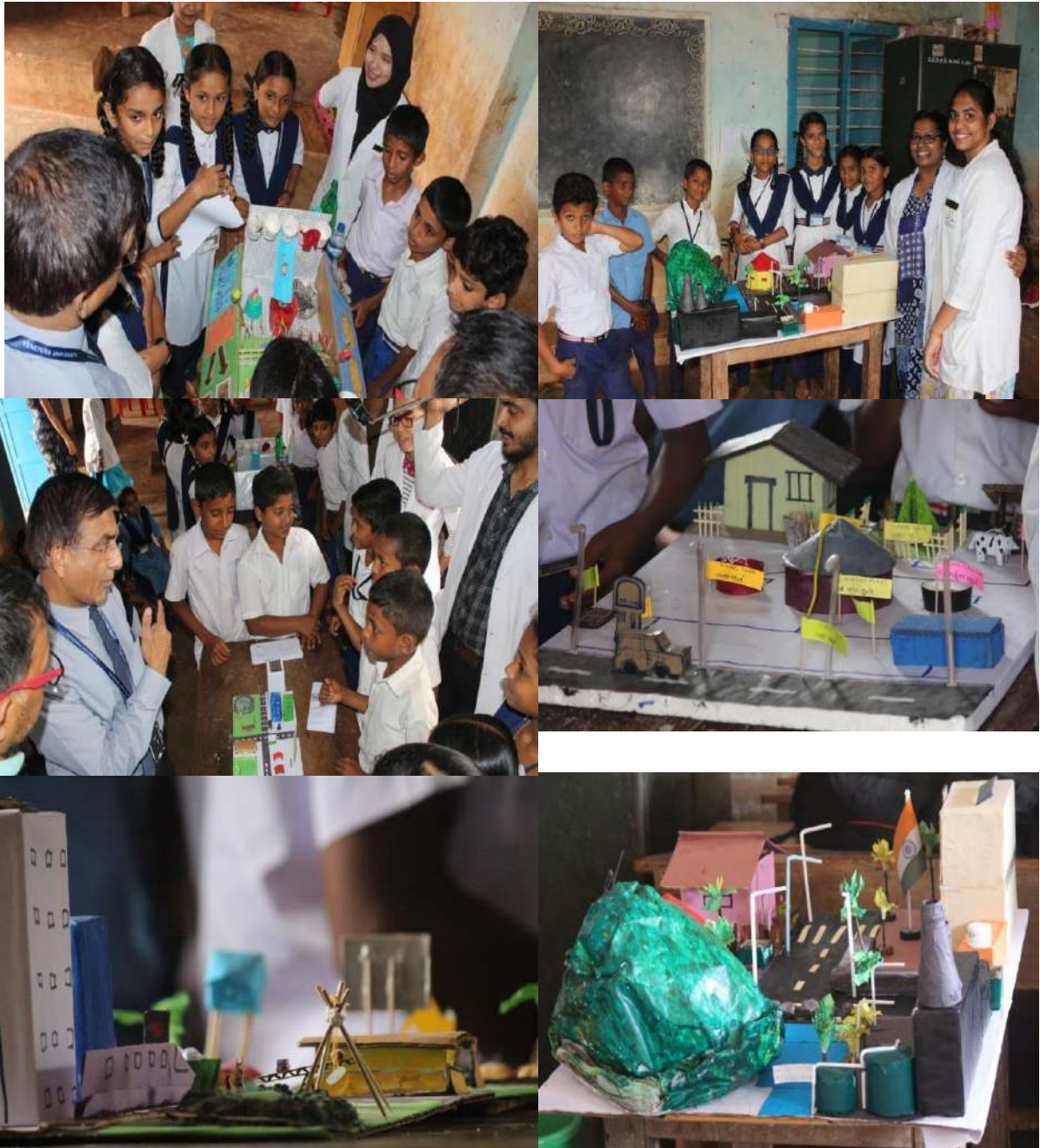
FIGURE 12: SWACHH MELA, MODEL COMPETITION