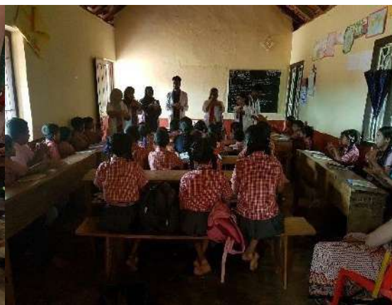
HAND HYGIENE DEMONSTRATION