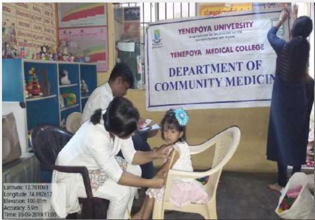
Latitude: 12.781093 Longitude: 74.892617 Elevation: 100.01m Accuracy: 5.9m Time: 30-09-2019 11:05