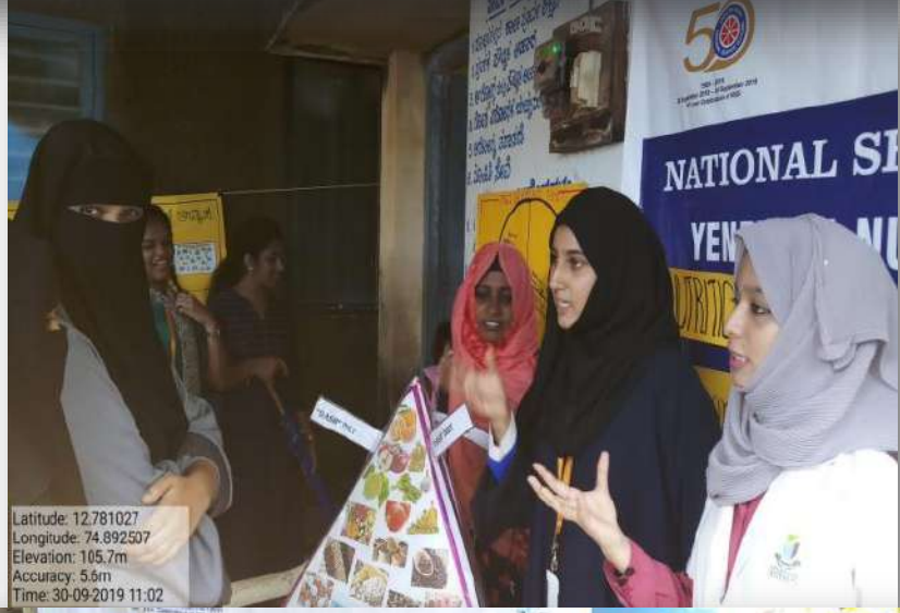
Latitude: 12.781027 Longitude: 74.892507 Elevation: 105.7m Accuracy: 5.6m Time: 30-09-2019 11:02