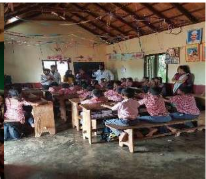
DEMONSTRATION OF WASTE SEGREGATION