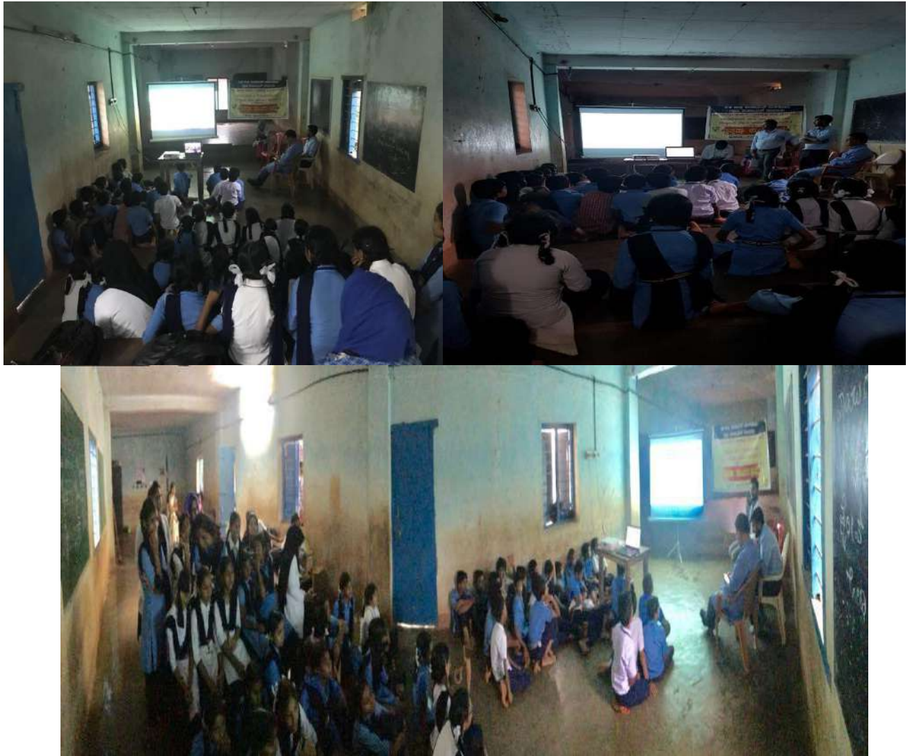
Figure 16: Movie Screening