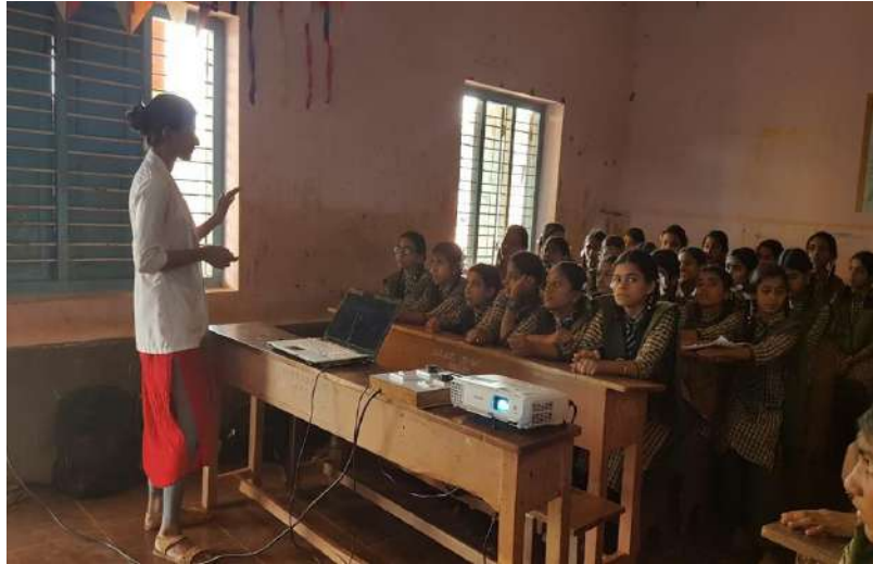
Figure 14: Personnel Hygiene Awareness